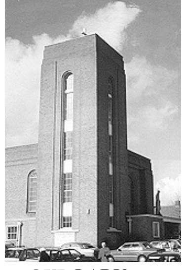
OUR LADY, QUEEN OF APOSTLES